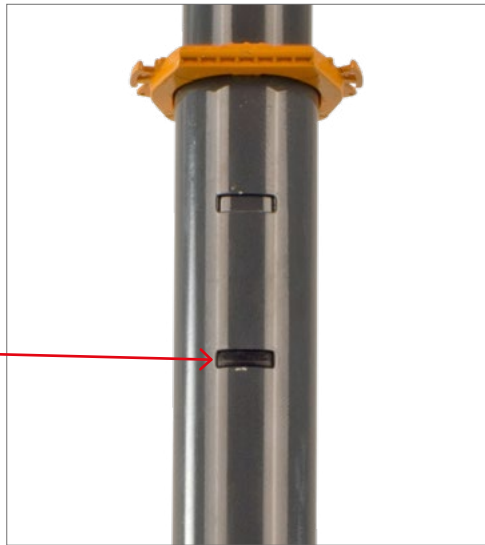
Locking pin #3

Make sure the boom is 90% extended, otherwise you cannot slide it back in. The boom contains three locking pins