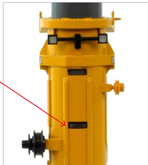
Locking pin #1