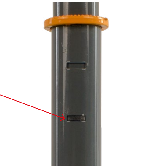
Locking pin #2